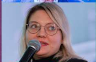
Aleksandra Owca Councilor of the City of Kraków