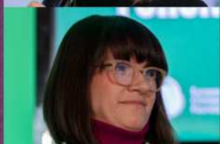
Monika Kwiatkowska Councilor of the City of Lublin